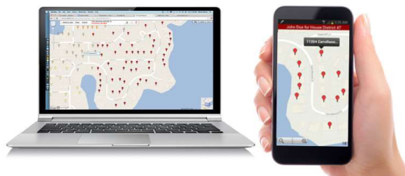
Our Google Maps tool makes canvassing easy and efficient

Monthly Voter Updates Daily AB/EV Updates You Own Your Data Robust Voter Targeting Volunteer Management GOTV Adopt-A-Voter Financial Management Donor Prospecting Walk List Mapping Micro-Targeting Mobile App Powerful Multi-Mail Merge Voter Score Ranking System Petition Printing & Tracking Barcoding ...and much more!